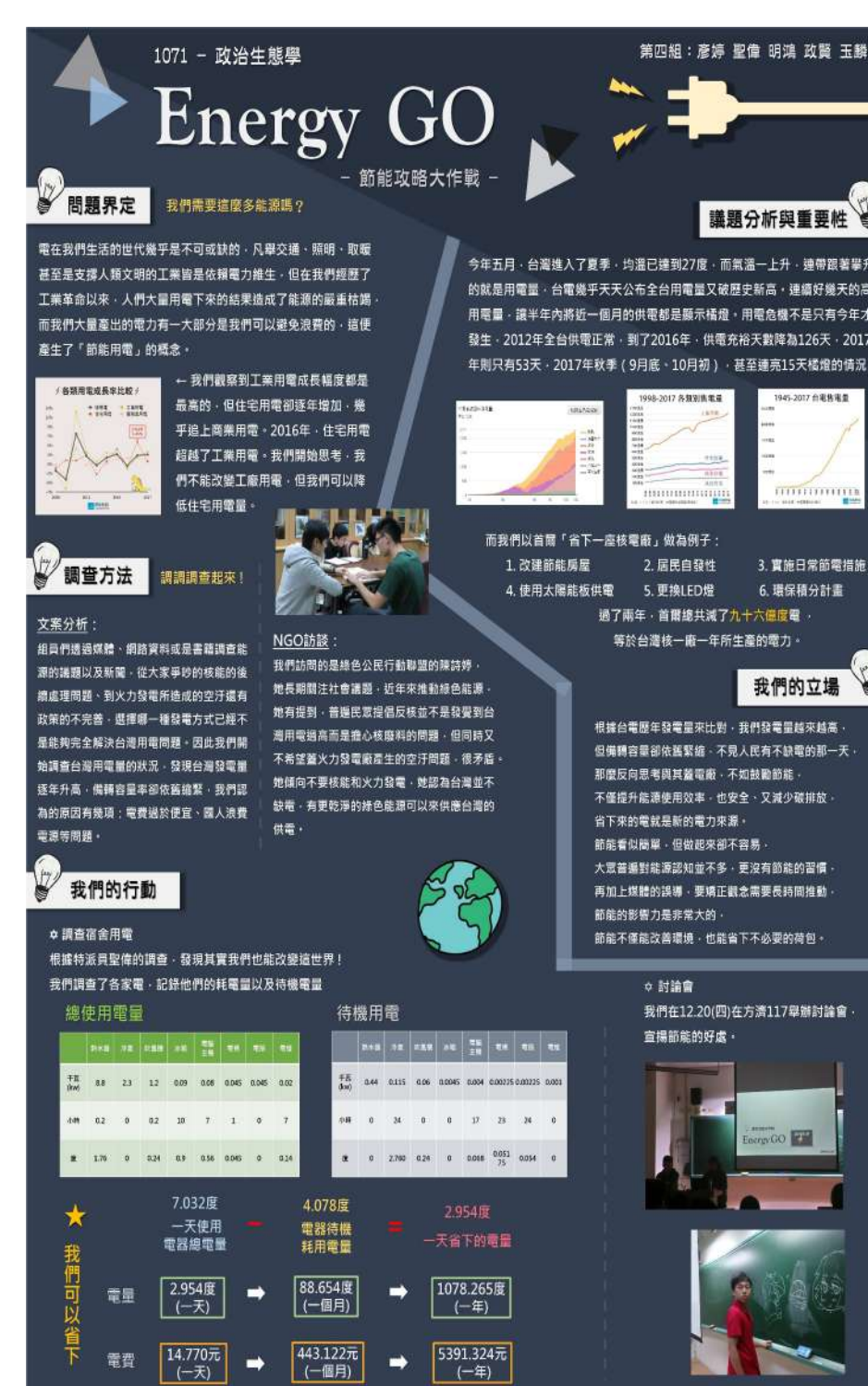
Final report poster